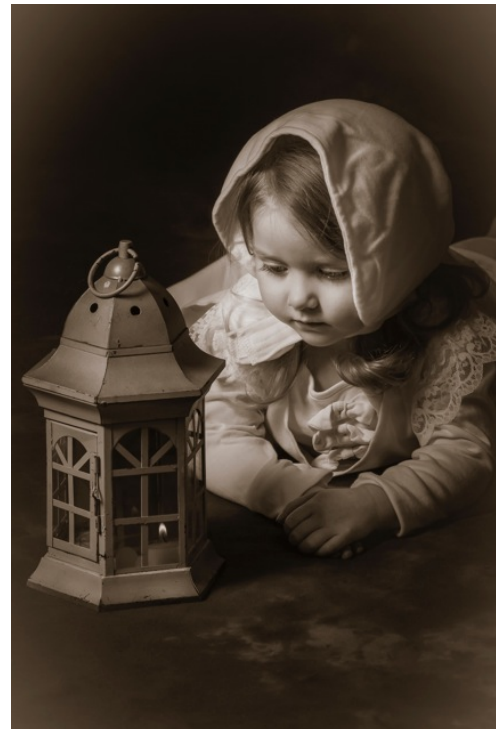
A pair of images from Freddie McArdle.