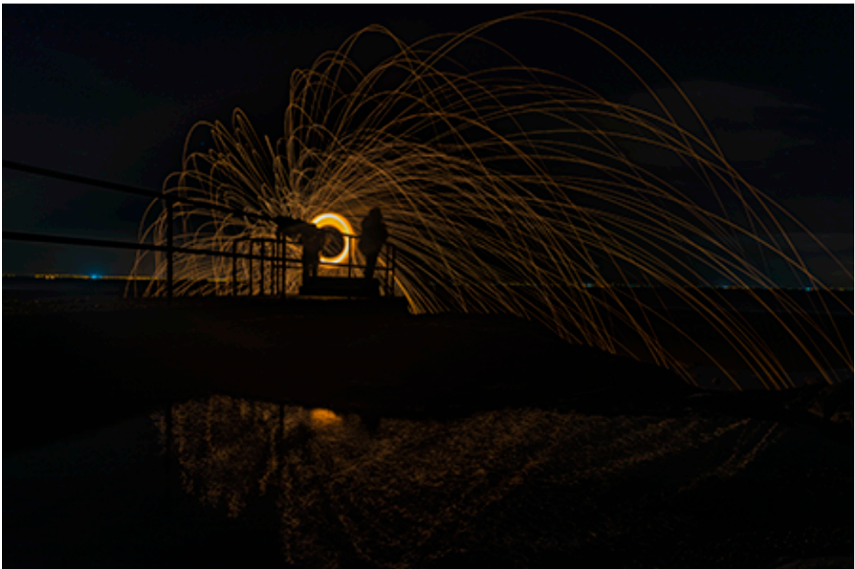
Mark illuminates Conor's outline with this burning steel display